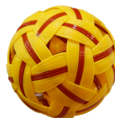
Women | Junior