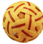
Women | Junior